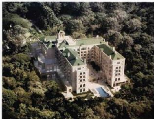
Clockwise from far left: Catamaran Meltemi sails around the Andaman Islands; Teardrop Hotel's newly renovated Fort Bazaar in Sri Lanka; the new Palácio Tanagará, opening in São Paulo's famous Burle Marx Park